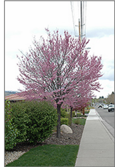
Eastern Redbud (tree form) in bloom

This tree does best in full sun to partial shade. It prefers to grow in average to moist conditions, and shouldn't be allowed to dry out. It is not particular as to soil type or pH. It is highly tolerant of urban pollution and will even thrive in inner city environments, and will benefit from being planted in a relatively sheltered location. Consider applying a thick mulch around the root zone in winter to protect it in exposed locations or colder microclimates. This is a selection of a native North American species.