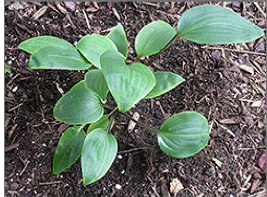
Purple Heart Hosta