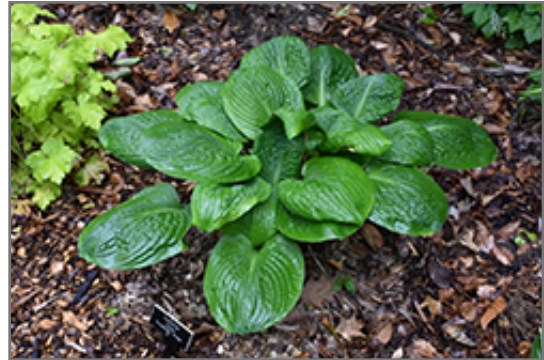
Potomac Pride Hosta