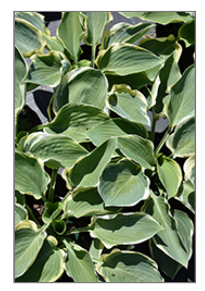
Orion's Belt Hosta foliage

A deep green glossy leaf center with pure white margins; leaf is heart shaped, deeply ribbed and corrugated; spikes of pale lavender flowers in late spring to early summer; a stunning specimen in the garden or border