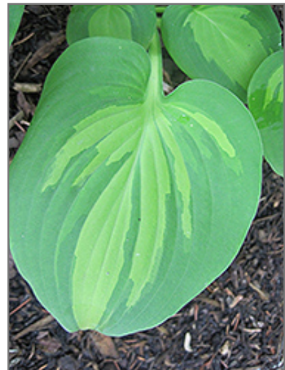
Olive Branch Hosta foliage