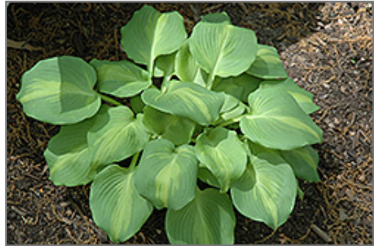
Olive Branch Hosta

Olive Branch Hosta is recommended for the following landscape applications;