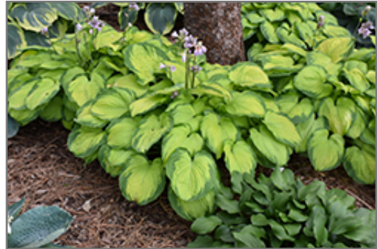
Old Glory Hosta