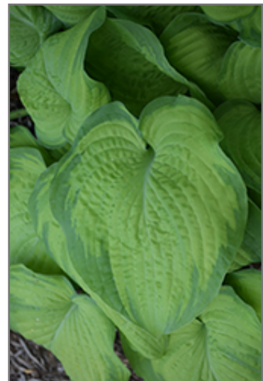
Old Glory Hosta foliage