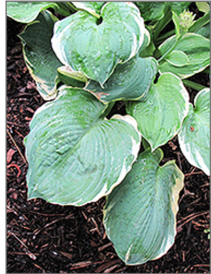
My Friend Nancy Hosta