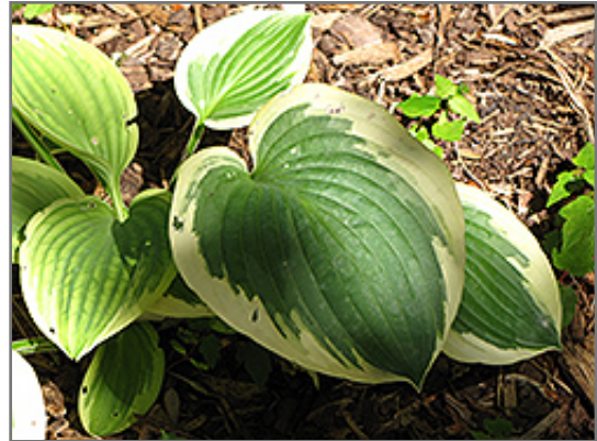
Mount Tom Hosta