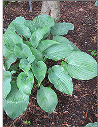
Moonlight Sonata Hosta