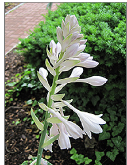
Millennium Hosta flowers