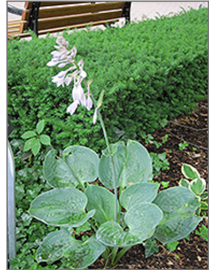
Millennium Hosta

Millennium Hosta is recommended for the following landscape applications;