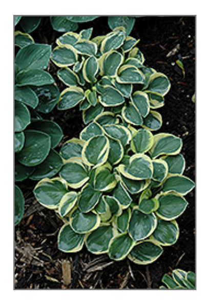
Mighty Mouse Hosta

Mighty Mouse Hosta is recommended for the following landscape applications;