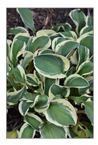
Mighty Mouse Hosta foliage