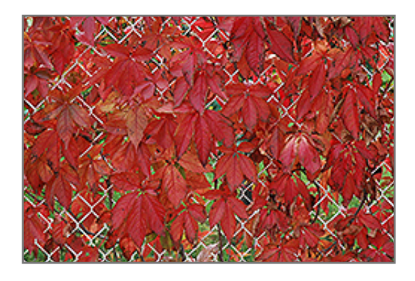
Englemann Ivy in fall

Englemann Ivy will grow to be about 40 feet tall at maturity, with a spread of 24 inches. As a climbing vine, it tends to be leggy near the base and should be underplanted with low-growing facer plants. It should be planted near a fence, trellis or other landscape structure where it can be trained to grow upwards on it, or allowed to trail off a retaining wall or slope. It grows at a fast rate, and under ideal conditions can be expected to live for approximately 20 years.