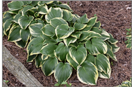
Memories of Dorothy Hosta