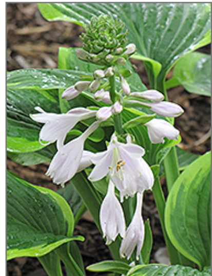
Mayan Moon Hosta flowers