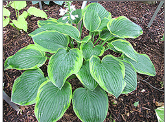
Mayan Moon Hosta