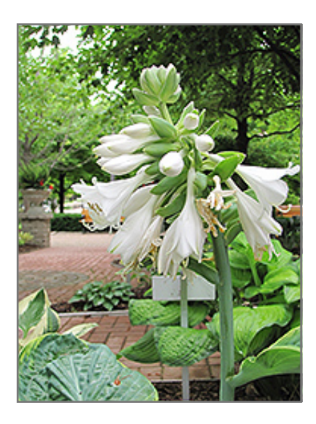
Maple Leaf Hosta flowers