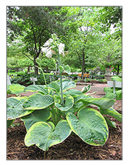
Maple Leaf Hosta

Maple Leaf Hosta is recommended for the following landscape applications;