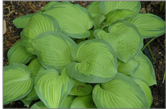
Lunar Orbit Hosta

Lunar Orbit Hosta is recommended for the following landscape applications;