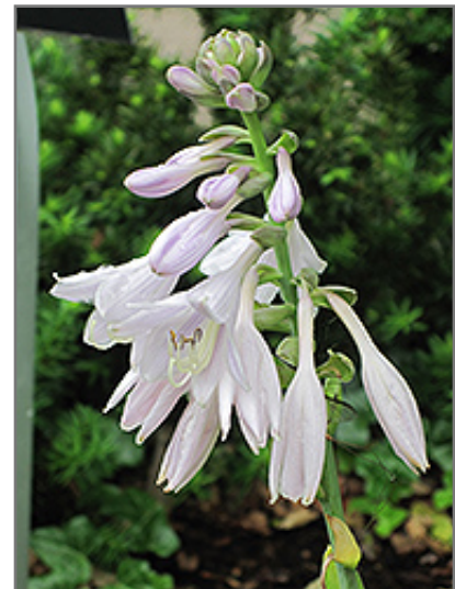
Lunar Orbit Hosta flowers