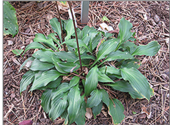
Little Red Rooster Hosta