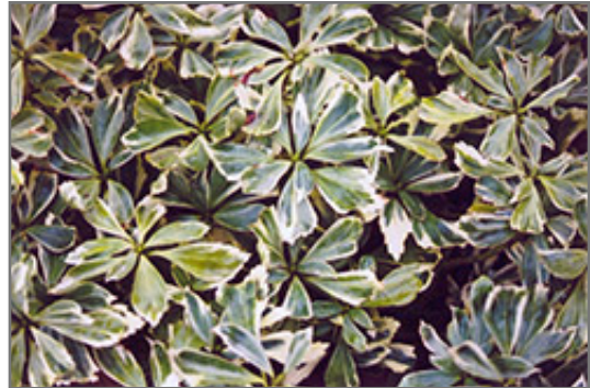
Silver Edge Japanese Spurge foliage