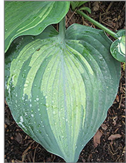
Lakeside Shoremaster Hosta foliage