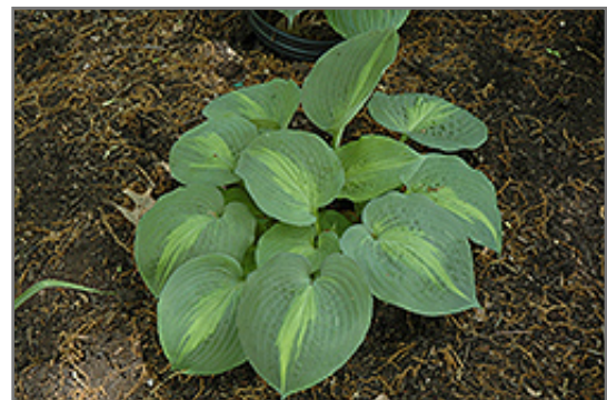
Lakeside Shoremaster Hosta