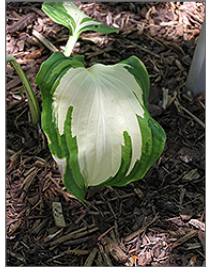
Lakeside Love Affair Hosta foliage