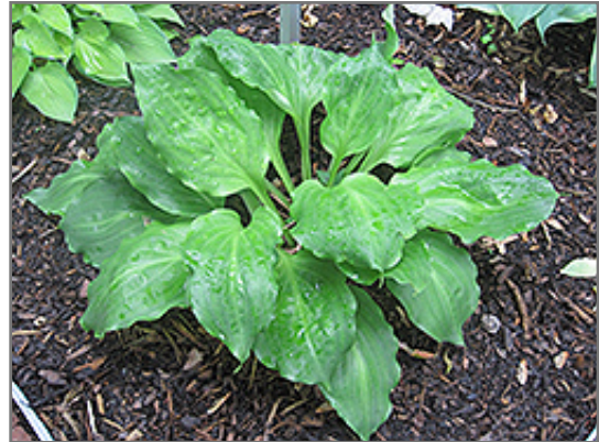
Lakeside Looking Glass Hosta

Lakeside Looking Glass Hosta is recommended for the following landscape applications;