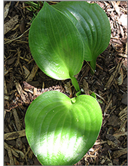
Lakeside Iron Man Hosta