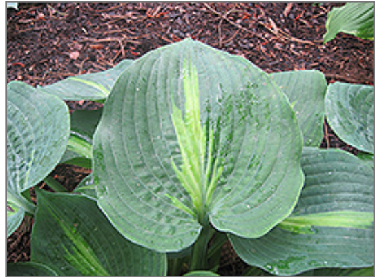
Lakeside Beach Captain Hosta foliage