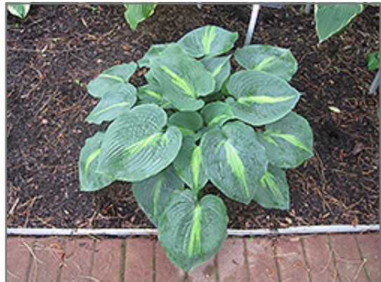
Lakeside Beach Captain Hosta