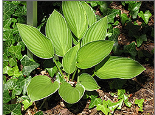
Lady Godiva Hosta