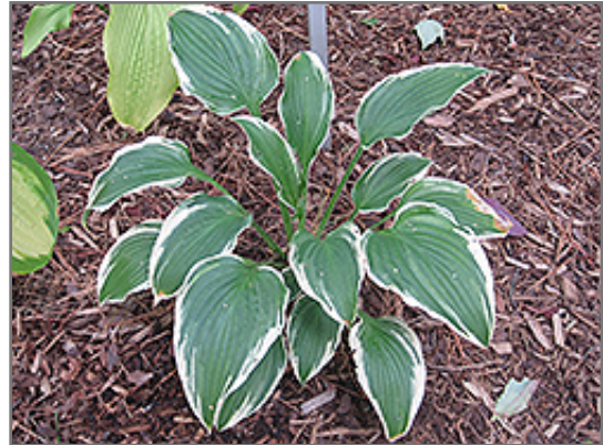
Lacy Belle Hosta