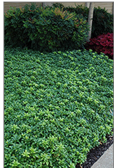
Green Sheen Japanese Spurge