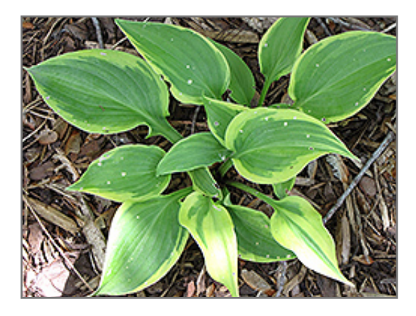
Katie Q Hosta