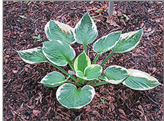
Karin Hosta