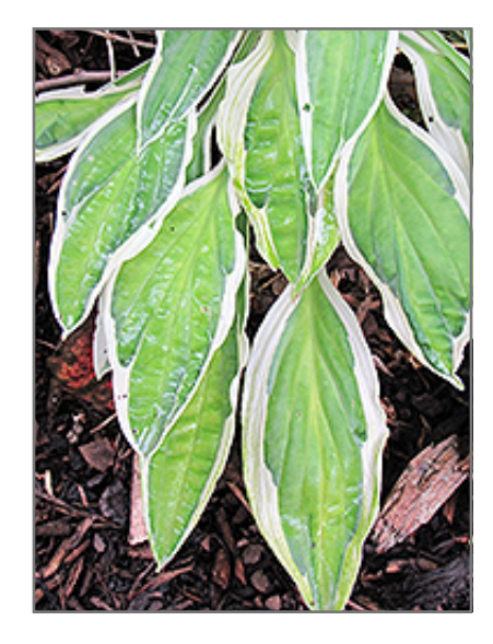
Juha Hosta foliage

This is a relatively low maintenance plant, and is best cleaned up in early spring before it resumes active growth for the season. Gardeners should be aware of the following characteristic(s) that may warrant special consideration;