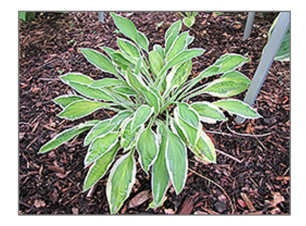
Juha Hosta