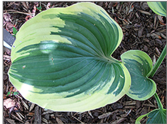
Ivory Coast Hosta foliage

Ivory Coast Hosta is recommended for the following landscape applications;