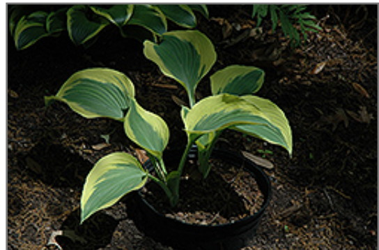
Ivory Coast Hosta