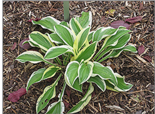
Iron Gate Delight Hosta