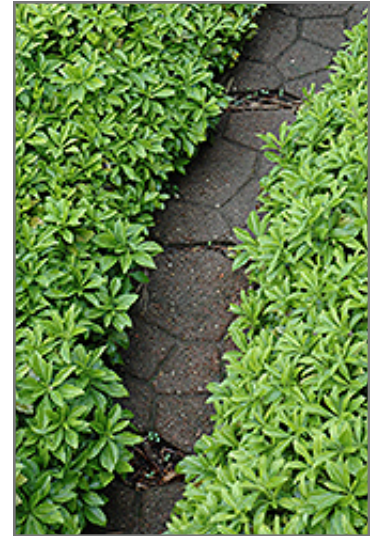
Green Carpet Japanese Spurge