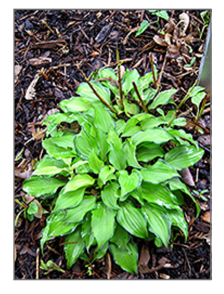
Hidden Cove Hosta