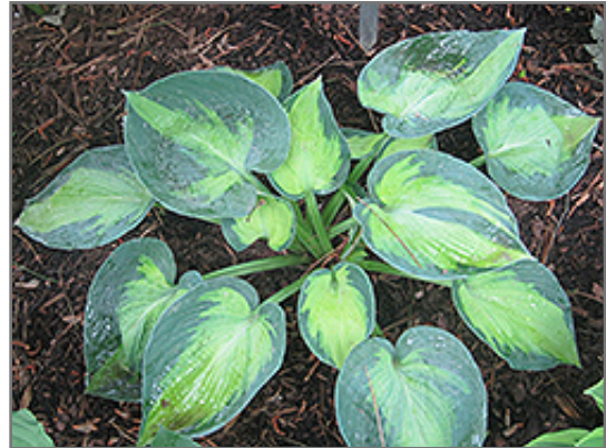
Heat Wave Hosta