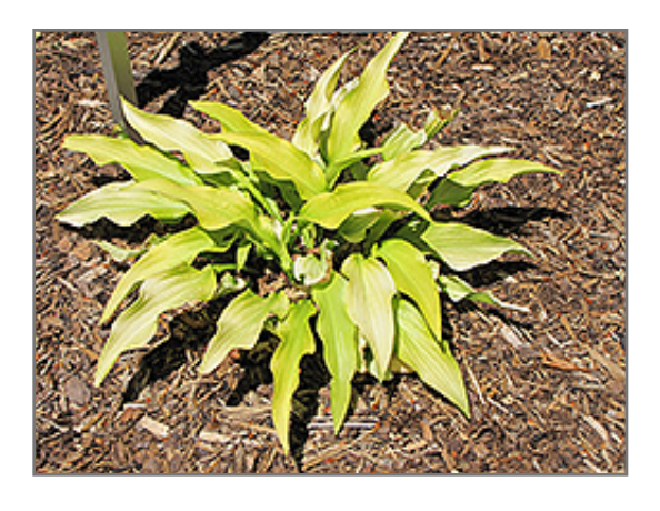
Hadspen Sapphire Hosta