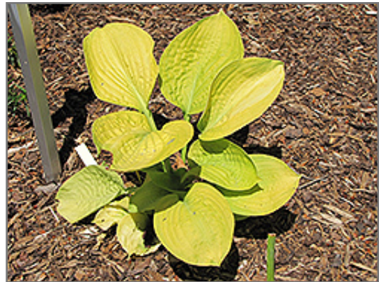
Golden Waffles Hosta