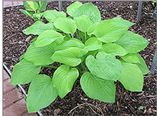
Golden Sunburst Hosta