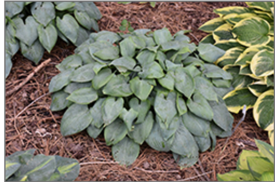
Fragrant Blue Hosta