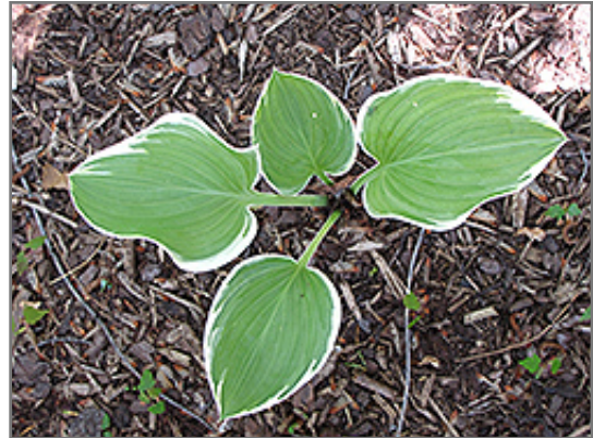
Forest Fire Hosta