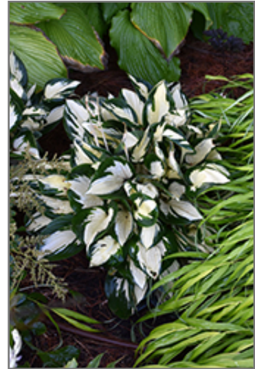
Fire and Ice Hosta

Fire and Ice Hosta is recommended for the following landscape applications;