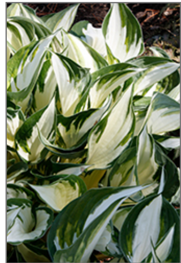
Fire and Ice Hosta foliage