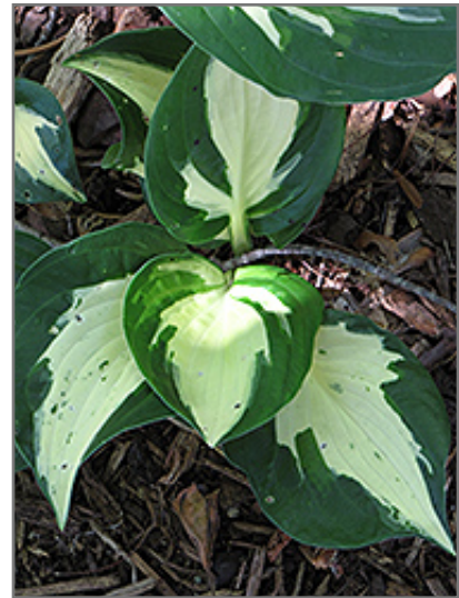
Eternal Flame Hosta foliage

Eternal Flame Hosta is recommended for the following landscape applications;