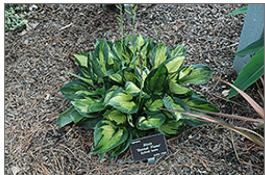
Eternal Flame Hosta