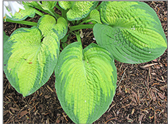
Eskimo Pie Hosta foliage

Eskimo Pie Hosta is recommended for the following landscape applications;