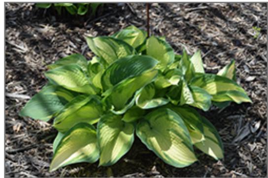
Eskimo Pie Hosta