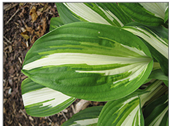
Enterprise Hosta foliage