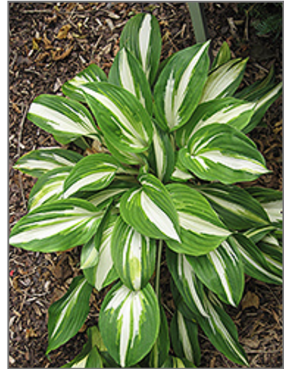
Enterprise Hosta