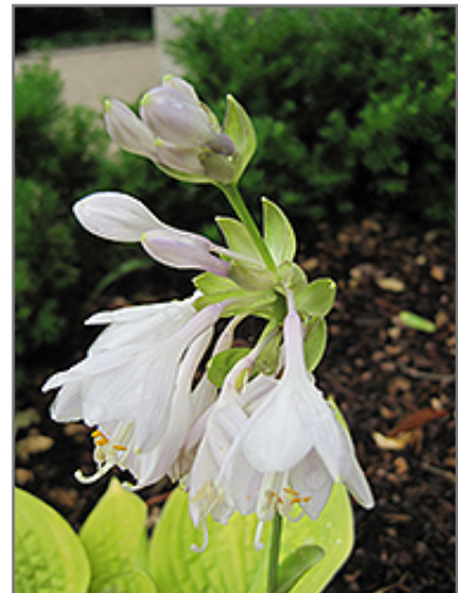
English Sunrise Hosta flowers