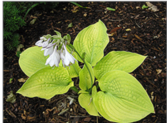
English Sunrise Hosta