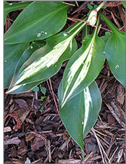
Dixie Chickadee Hosta foliage