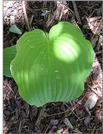
Darwin's Standard Hosta foliage