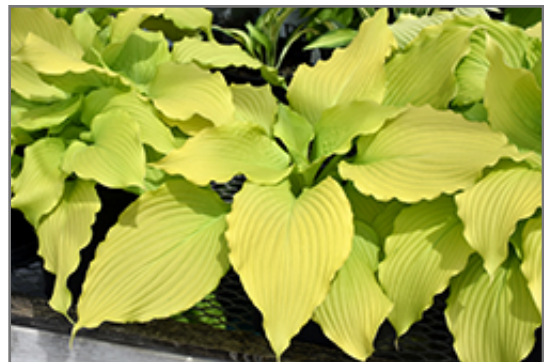
Dancing Queen Hosta foliage