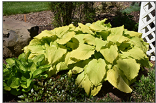
Dancing Queen Hosta

Dancing Queen Hosta is recommended for the following landscape applications;