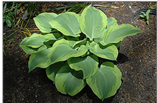
Climax Hosta