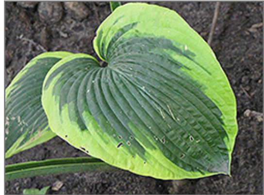
Climax Hosta foliage

Climax Hosta is recommended for the following landscape applications;