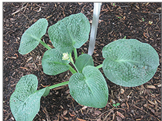
Clear Fork River Valley Hosta