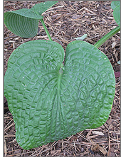
Clear Fork River Valley Hosta foliage