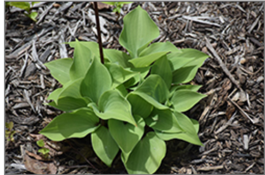
Cinnamon Sticks Hosta

Cinnamon Sticks Hosta is recommended for the following landscape applications;