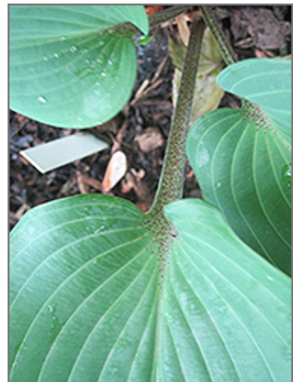
Cinnamon Sticks Hosta foliage